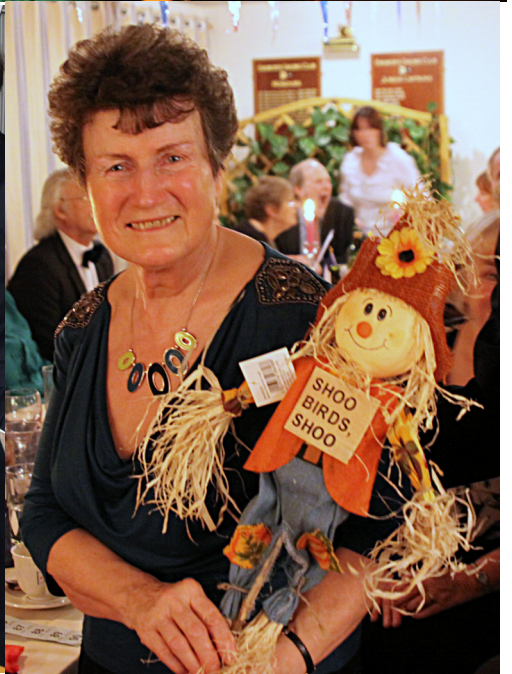
Scenes from the Annual Dinner, Saturday 21st January 2012